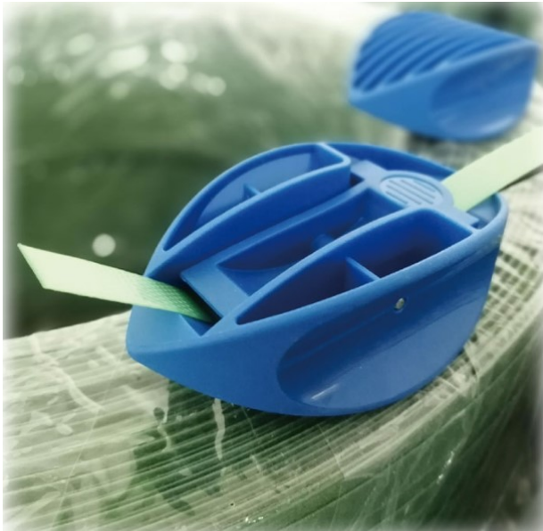
PALLET THREADING TOOL

Pallet Strap Feeder B190 is an innovative tool designed to revolutionize pallet threading, ensuring faster, safer, and more ergonomic operations. Made from high-quality materials, it simplifies the task of threading plastic straps under pallets. Pallet Strap Feeder B190 features a 1900mm highly flexible fiber rod and a durable polyurethane clip , which work together to streamline the process, eliminating common issues like straps getting stuck or requiring excessive bending. Compatible with PP (Polypropylene), PET (Polyester) , and other straps up to 25mm in width and 1.5mm in thickness , this versatile tool is a must-have for warehouses, shipping facilities, and logistics operations.